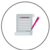
Quick to Order

SoGEA is packed full of benefits that you can't get with standard broadband packages. SoGEA faults are resolved much quicker since customers only need to provide one support call to their SoGEA provider. SoGEA also enables for easier remote working solutions in your business, school or home.